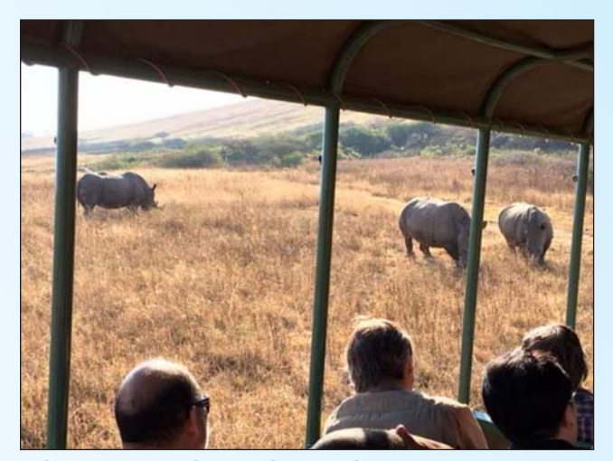
Delegates viewing Rhino on the game drive

The IMLA Conference was very well organised and hosted by the staff of the Durban University of Technology. The program contained a wide variety of topics to inform and stimulate discussions and provided delegates with an excellent opportunity to meet and network with colleagues in the international MET industry.