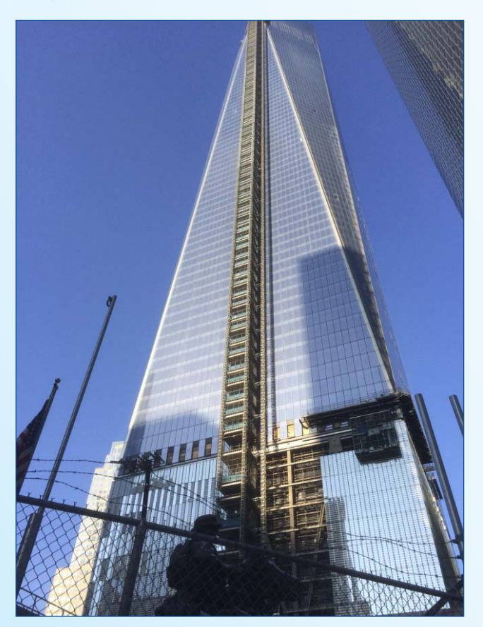
Figure 2 - A Trylon tower

Seafaring men and women's daily routines include watch standing, ever increasing paperwork when off watch, preparation for increased inspection regimes, deck work and engine room maintenance and preservation all with reduced manning and the call for MLC (maritime labor convention requirements for reduced hours). It's as if those in charge who have retired from going to sea and now work ashore and making policy are far removed from the current realities of the modern