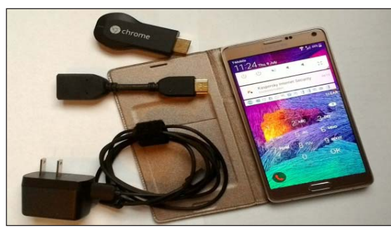
Figure 2 - Google Chromecast, extension and power cord

Need to make a presentation and don't have a projector? Have a large screen display TV and a Smart Phone? On the move, travel a lot and can't carry a large amount of weight or computer equipment because of travel weight restrictions. Maybe you're at home and don't feel like being chained to your desktop computer or computer room, try Google Chromecast. The Google Chromecast HDMI dongle fits right into the back of the TV's HDMI port and instantly turns your TV into an internet ready large screen display using your` mobile device; tested with an Android device.