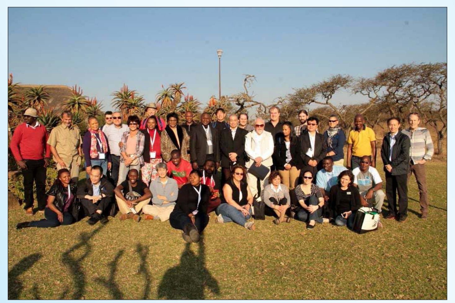
A group photo of some of the IMLA '23 delegates at the Tala Private Game Reserve