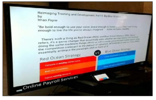
Figure 1 - 65 inch screen TV and Smart Phone