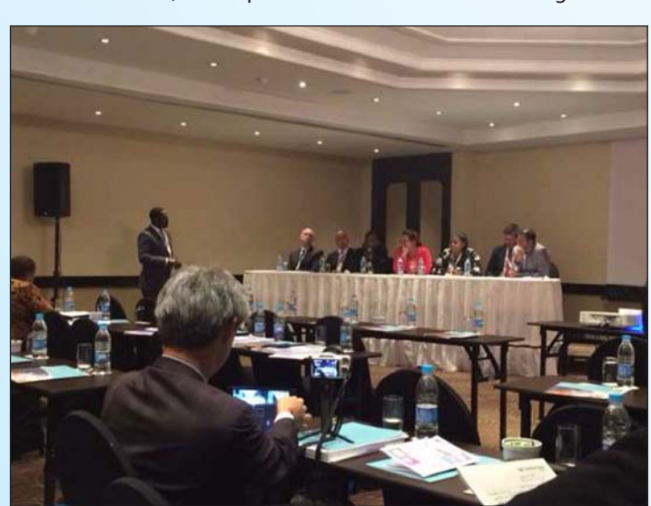
One of the IMLA '23 Panel Discussions

The final session took place at Tala private game reserve - located in the hills of a peaceful farming community, close