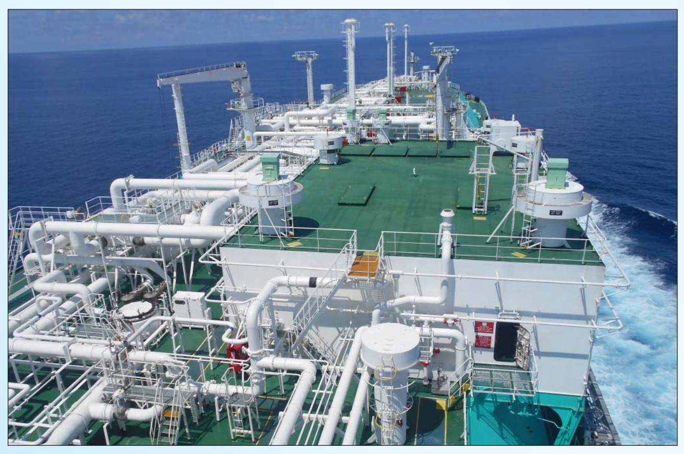
Figure 1 - LNG vessel

Technology was supposed to be a game changer for the maritime industry, making a number of shipboard reporting requirements much easier and giving the seafarer some relief from the complex nature of today's maritime environment; yet it seems one finds that much of the same paperwork requirements that initially led to the adoption of new technologies and automated processes onboard for reporting requirements back to the home office in the first place still has to be done, not because there's anything necessarily wrong with the electronic data or reporting format, but merely because home office requirements continue to also require the previous manual reporting; double the requirements and work. Additionally, in many other cases ashore there also appears to be multiple silos of operations and requirements (i.e., lack of coordination and efficiency) sending a